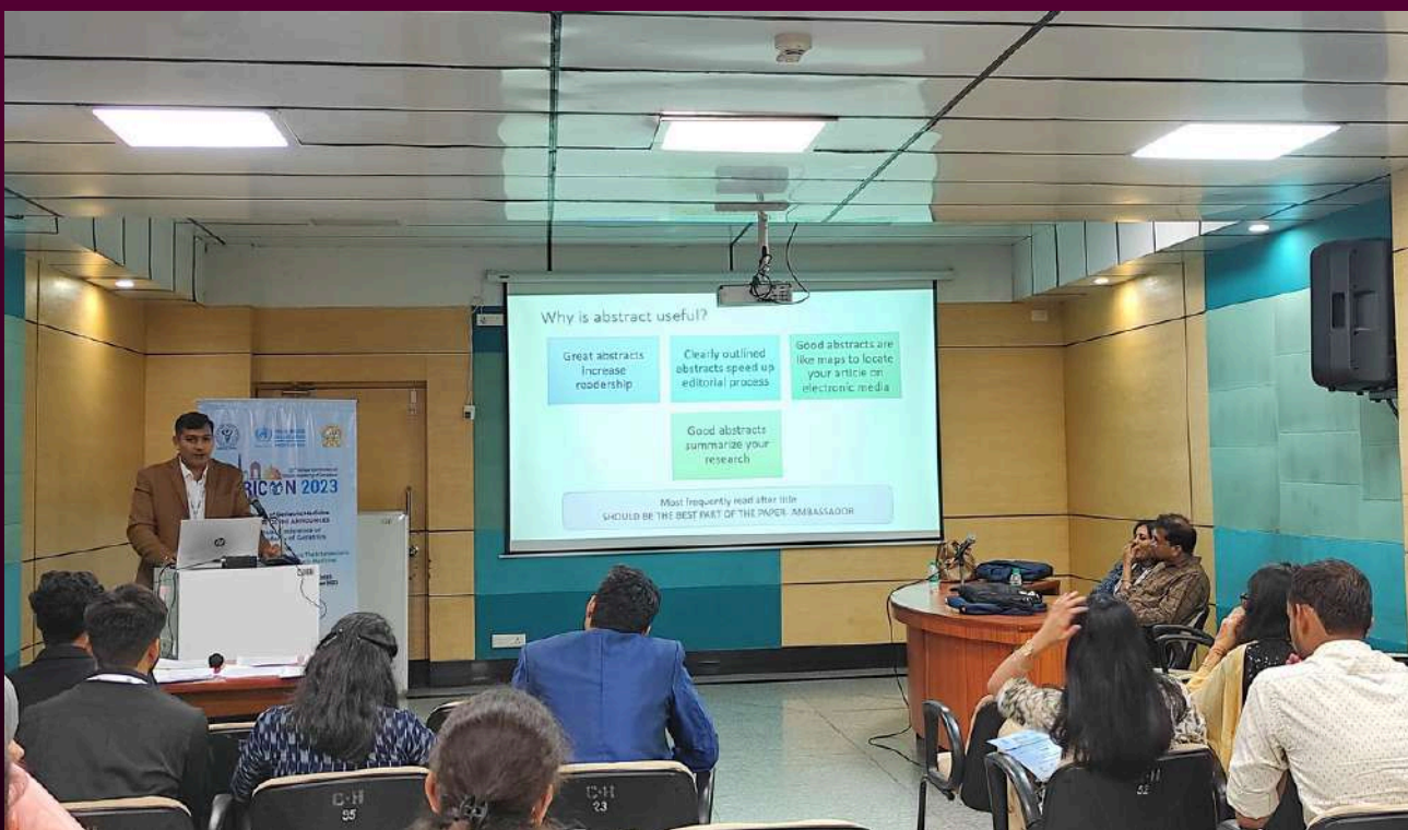
ABSTRACT WRITING WORKSHOP